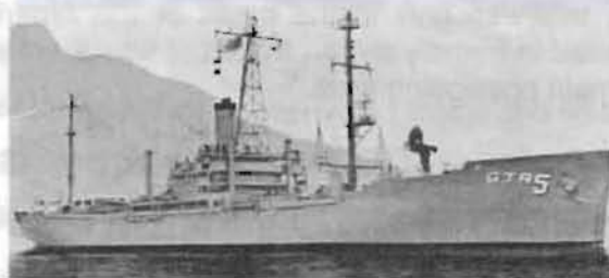
USS Liberty 455 feet in length, 10,680 tons displacement