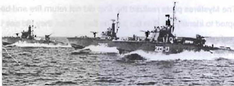
Figure 4: Israeli Motor Torpedo Boats

could not catch the unidentified ship and therefore requested air support. Two mirages were diverted from a patrol of the Sinai to assist. 39