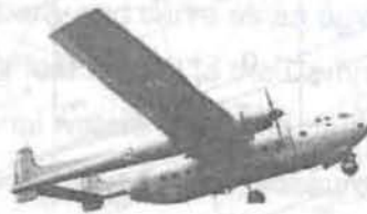
Figure 3: French Built Flying Box Car

Lieutenant (Junior Grade) Lloyd Clyde Painter confirmed reports of the flying box car reconnaissance aircraft: