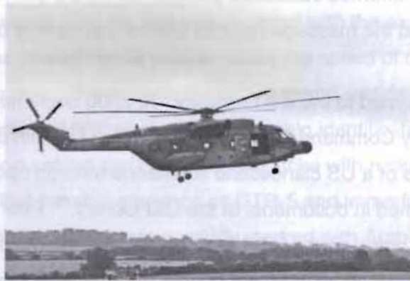
Figure 5: French-built Aerospatiale SA321

(Hornets) ... designed for heavy assault and antisubmarine operations. This model is the largest helicopter made in France and can carry thirty armed troops; it has a boat-type hull and stabilizing fins to permit amphibious operations." 59 After circling the ship, both helicopters departed and did not attempt communications or landing of crew with the ship.